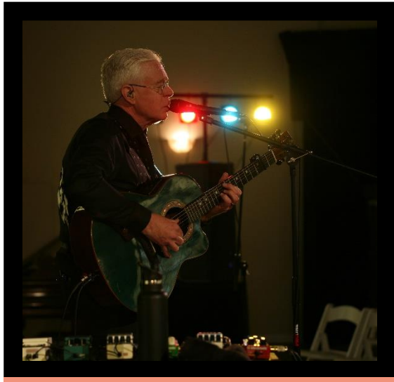
Bruce Cockburn - Seattle

with little backing, he carries 6-8 guitars, pedals and a Fishman Prefix Pro Preamp and Pickup system, which will allow his sound crew to create the sound they are looking for through the house soundboard. House lighting will be used at all venues. His equipment is carried in a tow-behind trailer on his bus.